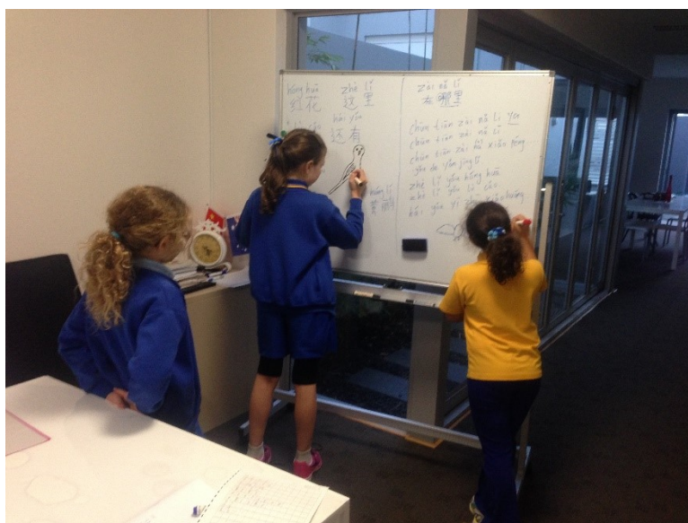
[Our 6-9 yo class photo (2015) ]

Include: 40 sessions during school terms valid for 12 months.